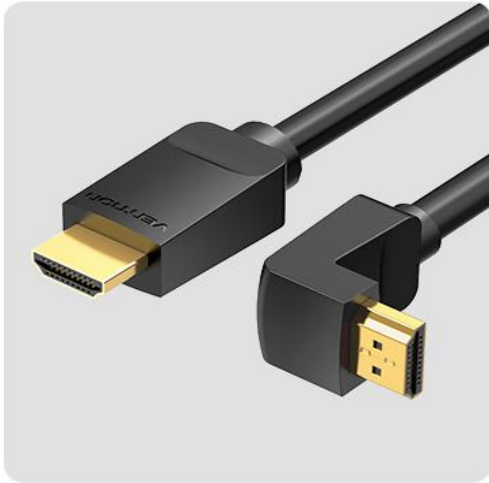
• 270 Degree