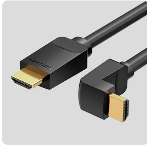
• 90 Degree

Note: You can directly contact customer service if you don't know the direction of the interface when purchasing