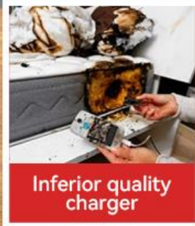
Inferior quality charger