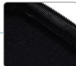
Soft velvet inner layer