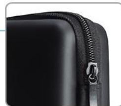
Thick PU+EVA material